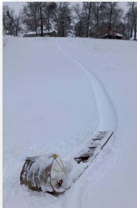
Toboggan fun