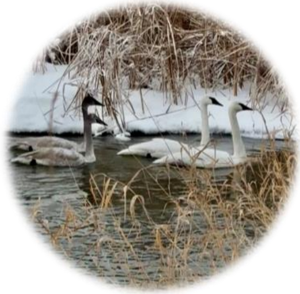
Swan Family