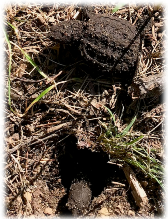
Baby snapping turtles emerging