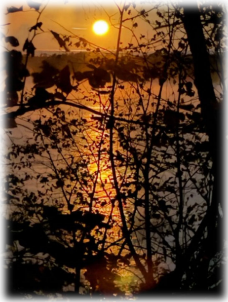
* Eastern view by Jane Kilgore