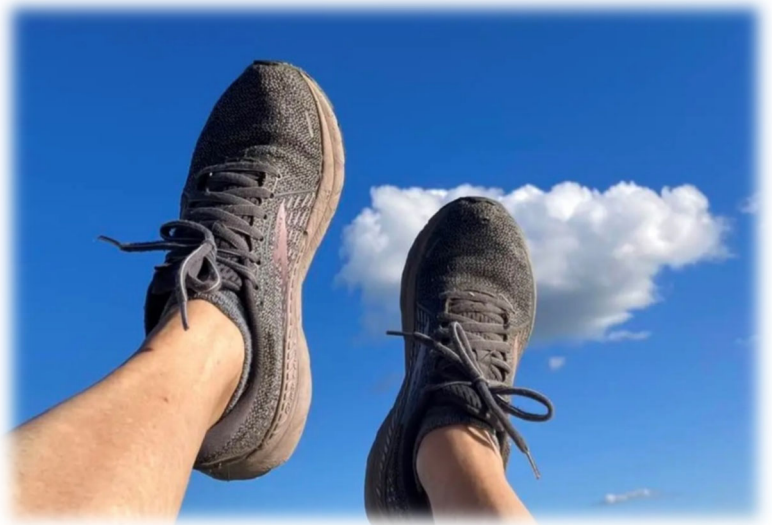
* Stepping on a cloud above the lake by Sue Bruns