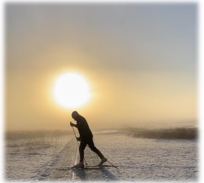
Lee Scotland skiing on the lake