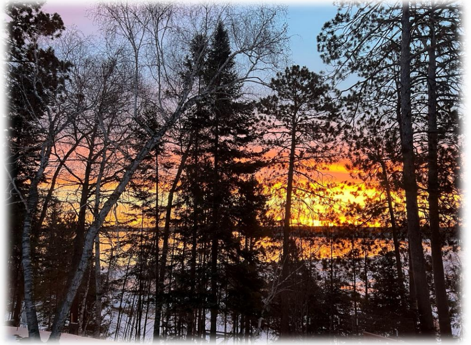
Open water during the winter