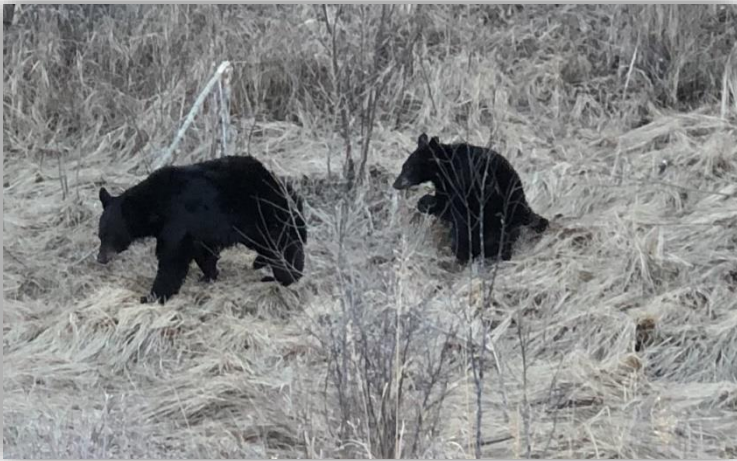
Bears out in April