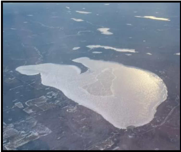
Aerial view of the lake