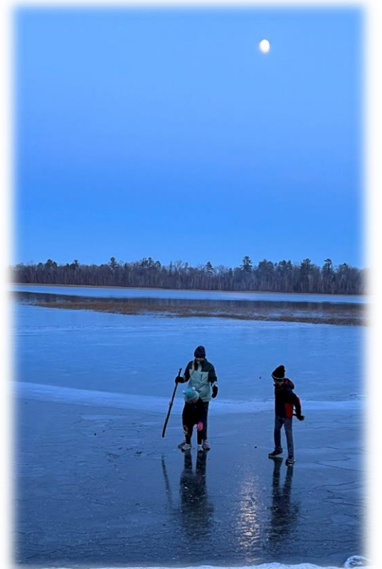
Grandkids on the new ice in November