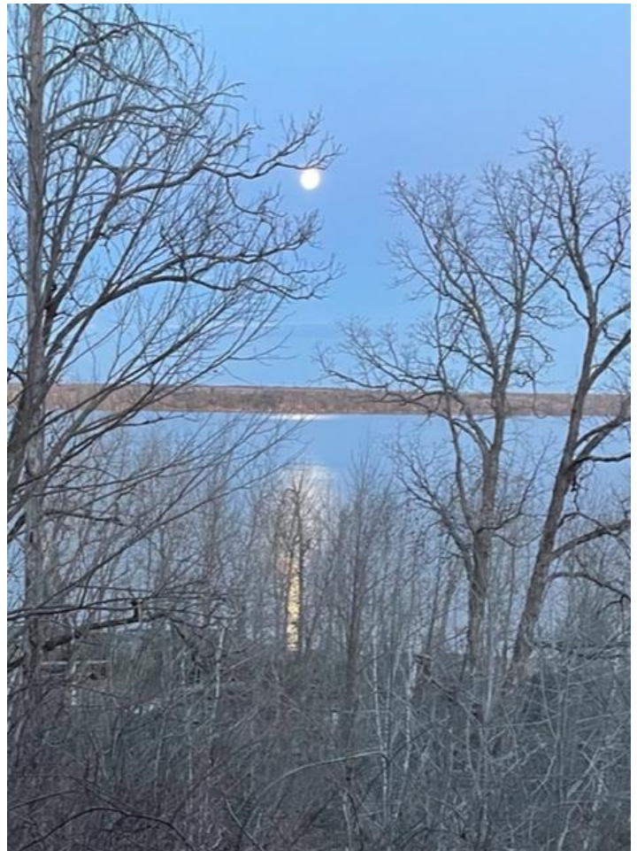
ICE OUT -MAY 4 TH AND FULL MOON!*