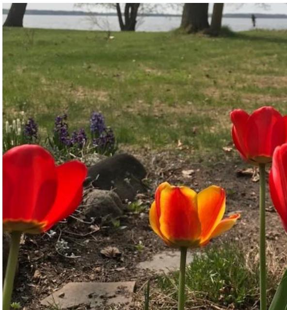
Spring comes to the lake...*