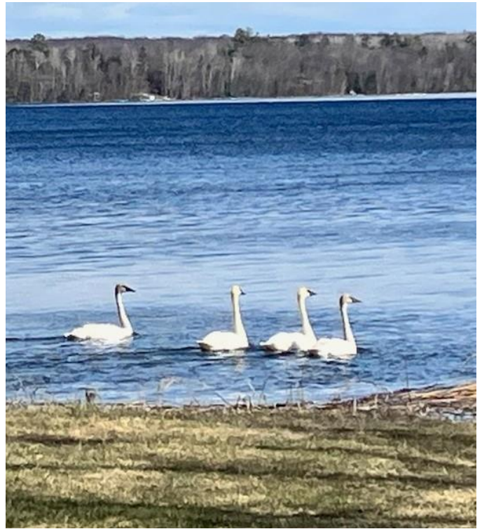
Swans on the north side