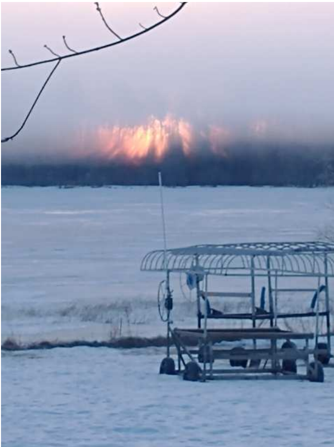
Sunrise on a foggy morning