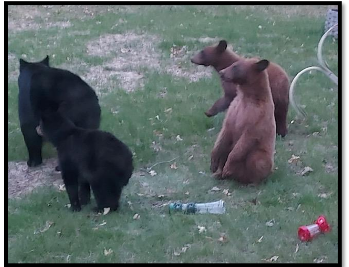
Attacking bird feeders in May...*submitted by Sue Bruns