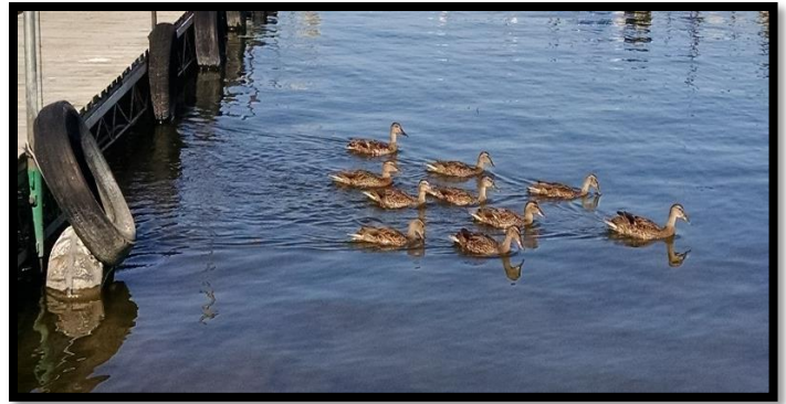
Dock ducks