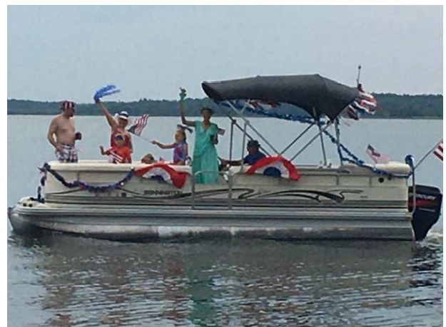
Participants in the 2020 parade

Back by popular demand will be our own Fourth of July Boat Parade around Lake Plantagenet on July 4th. A reminder with more information will be sent out!!