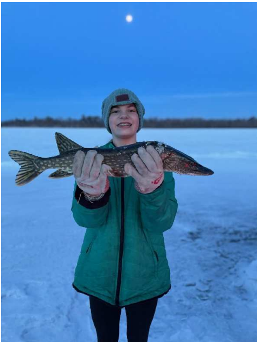
My granddaughter spearing