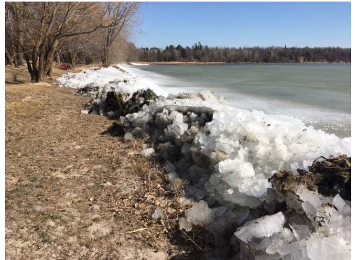
Ice heaves on north shore