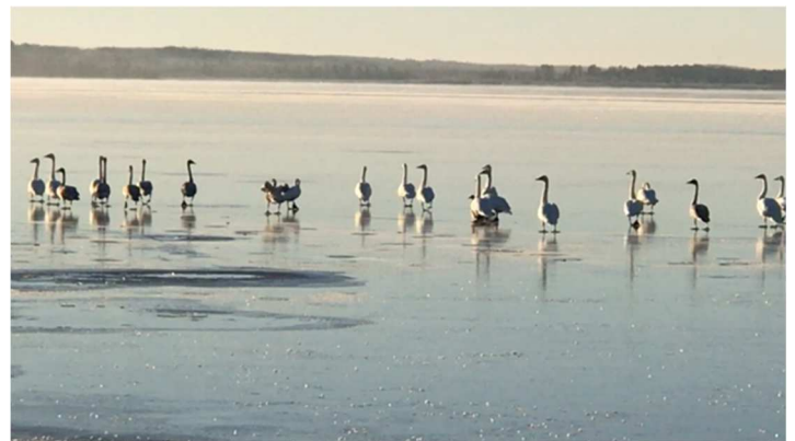
Swans on the ice—November 2020