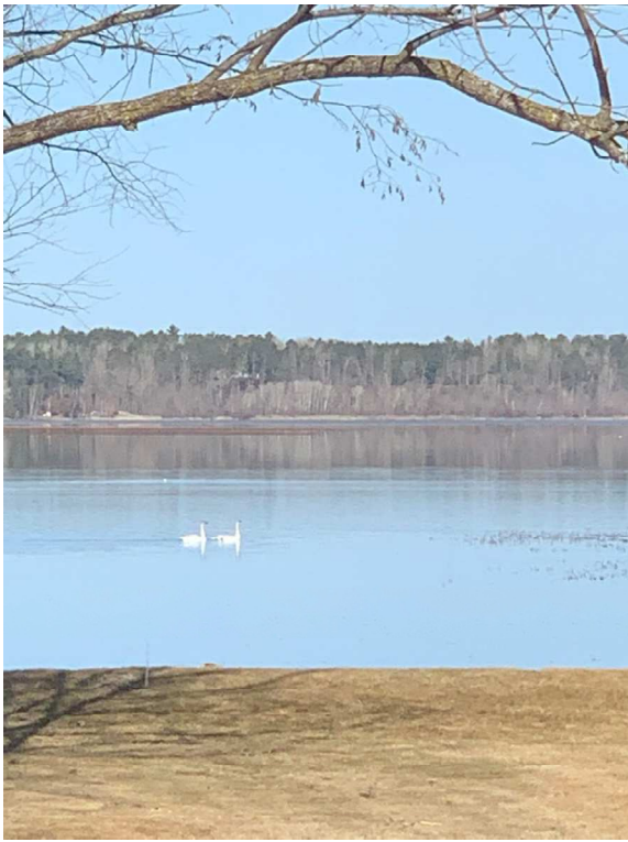
First day after ice-out