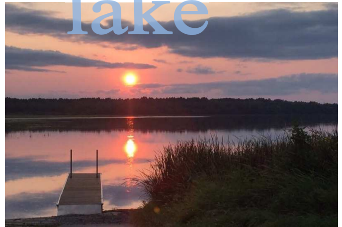
Sunset by the landing