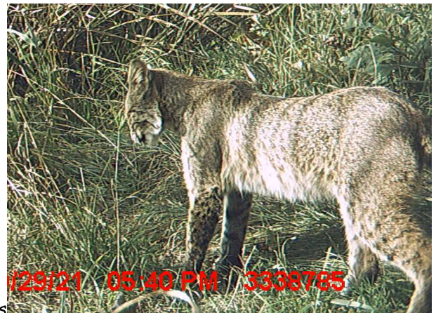
Bobcat along Schoolcraft River