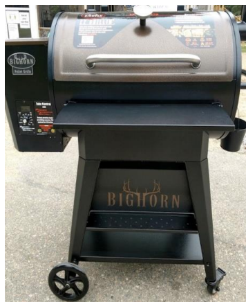
Brand new wood pellet grill