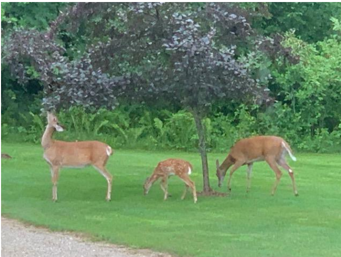
Deer munching on apples