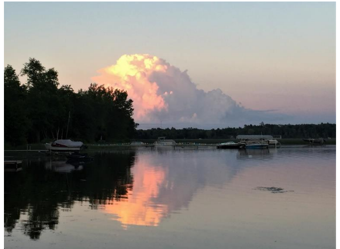
East Clouds at sunset