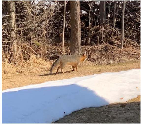
A chubby red fox