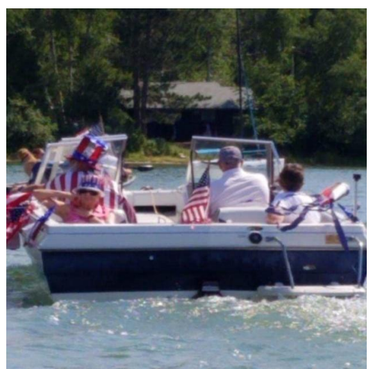
Participants in last year's parade

After a great success and lots of fun last year and back by popular demand is our own Fourth of July Boat Parade around Lake Plantagenet. Meet at <u>Balsam Beach at 3:00</u> on July 4th. A reminder will be sent out!!