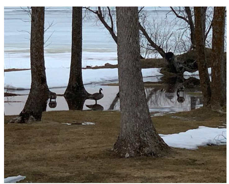
Geese on Lake Colliander