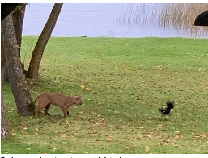
Bobcat chasing injured bird

Please send photos of the lake to: Lin Ward— <u>jward@paulbunyan.net</u>