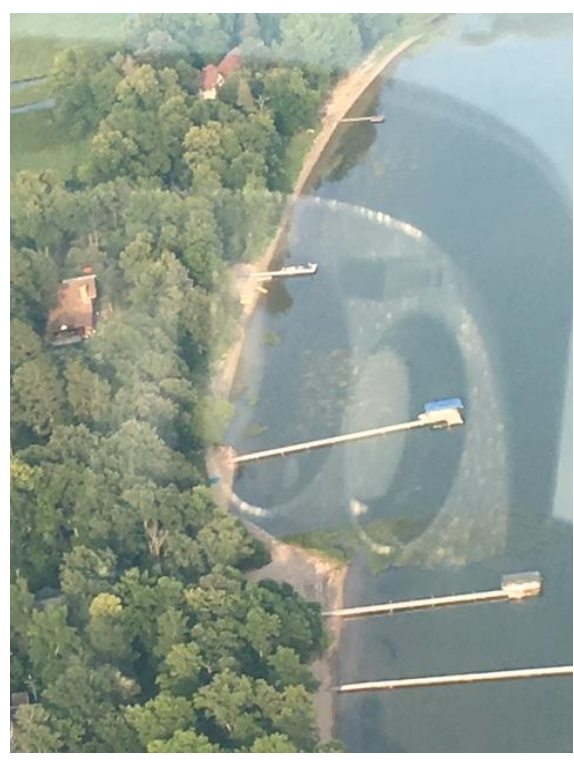
Aerial View of the north end of the lake

Please send photos of the lake to: Lin Ward— <u>jward@paulbunyan.net</u>